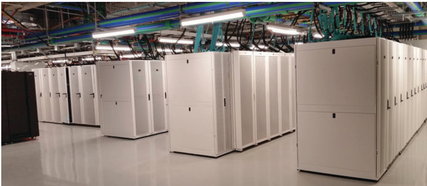
Cedar is the most powerful academic supercomputer in Canada and will support researchers across the nation.

To house Cedar, SFU built an entirely new data center with energy efficiency as a key requirement. It has a Power Utilization Efficiency of 1.07—only seven percent of consumed power goes to utilities, e.g., cooling pumps. Research groups across the city realized that SFU had a very large and energy efficient data center. And they wanted to co-locate some of their applications in the facility. According to Siegert, the response has been somewhat overwhelming. “It’s clearly more attractive for companies in the city to house their systems here than far away in another efficient data center.”