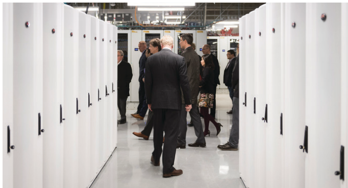
Partners from Compute Canada and WestGrid tour the new SFU Data Center in Burnaby, Canada where the Cedar supercomputer is located.

What’s more important is the latency for the applications, and that’s not affected by the level of blocking. So, we can run far larger parallel workloads—essentially across the entire approximately 30,000 cores—than what we initially had in mind.”